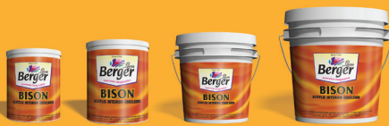
1 Ltr 4 Ltr 10 Ltr 20 Ltr